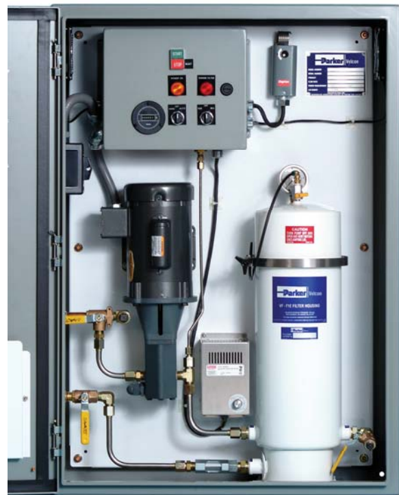
TP3 Series (TP3-MK3 Model Shown)

The TDS5-MK1 unit provides a non-intrusive, cost effective and convenient method of maintaining transformers in a dry condition. In addition, once the transformer is dried, the system can be retrofitted with Activated Alumina cartridges to reduce acidity in the transformer oil. This flexibility allows increased oil processing application compared to heat and vacuum systems.