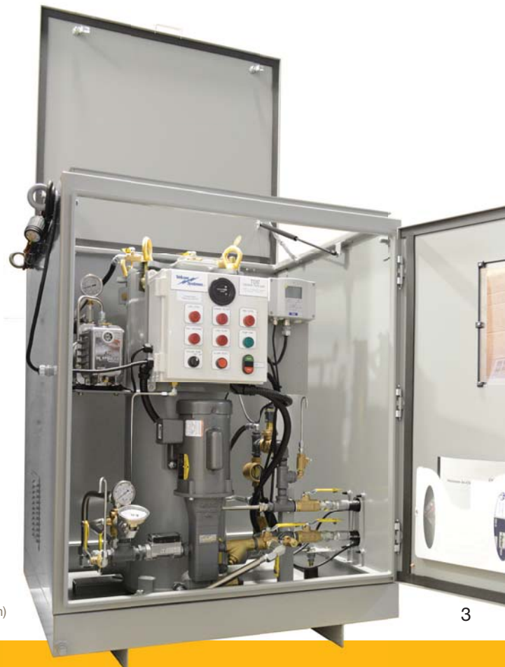
TDS5 Series (TDS5-MK1 Model Shown)

Quality components and comprehensive design features have made the TP3 an industry standard for on-line filtration. All components are fully enclosed in cabinet. Operation of the unit is unattended. A flow rate of 3 gpm keeps turbulence in the reservoir to a minimum and allows for maximum filter life.