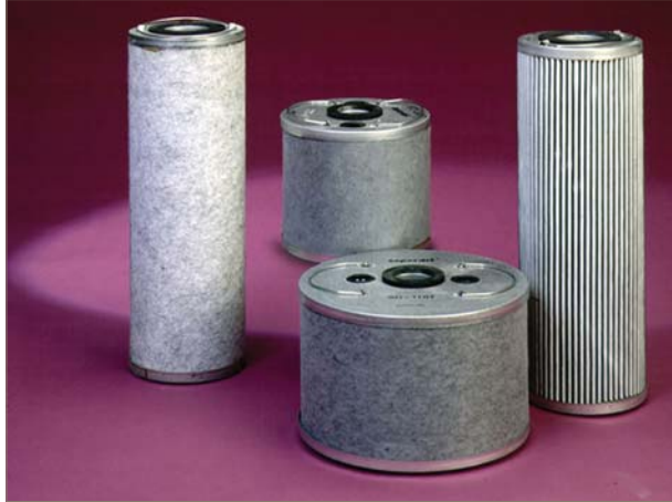
Superdri is a registered Trademark of Parker Hannifin.