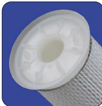
X100 Replacement end cap