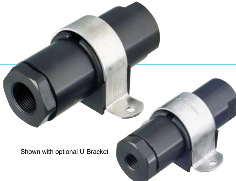
Shown with optional U-Bracket

†Other element ratings available on request *Available on 6IL only.