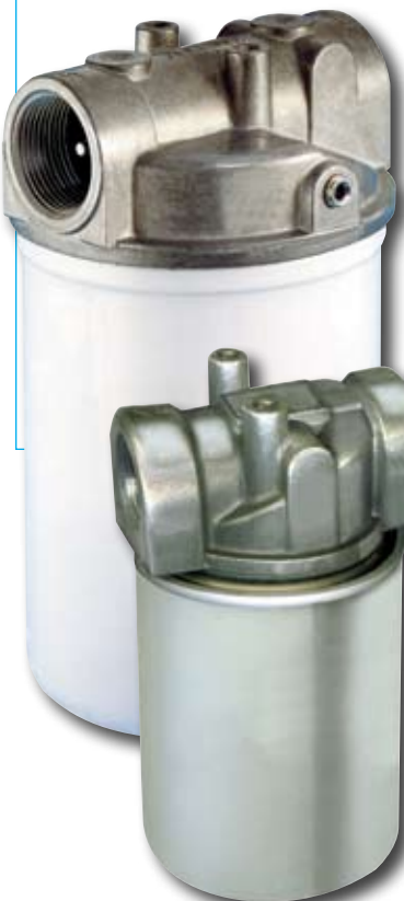
MODEL FEF-51 Element area 950 sq. in. Flows up to 60 GPM (return)