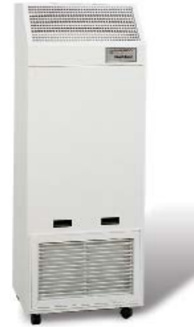
Enviroc Hospi-Gard® IsoClean®

Both HEPA filter and prefilter are easily accessible for replacement by authorized personnel.