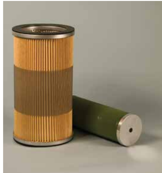
O-81588 and SO-415VX5 Separator

Parker Velcon coalescer and separator are installed together in the Vel-Max® housing to remove water and dirt from fuel. The fuel passes from the outside to the inside through the coalescer. Dirt is filtered out of the fuel and free/emulsified water in fuel is coalesced. The coalesced water droplets, which form on the inside of the coalescer, are repelled from going further down-stream by the separator. The water settles down to the sump where it is manually drained.