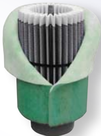
Filter element cat# 324-4610WK5 & housing cat# A10-0125-MT-080 w/hood removed. To order Filter Housings that accept accordion style filter elements go to page 17.